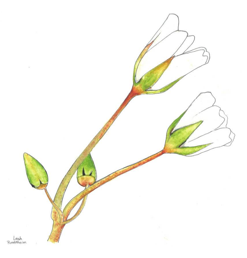
Limnanthes douglasii ssp. rosea male-sterile morph.